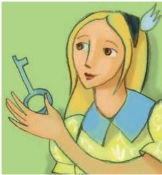
1 Alice with a .....