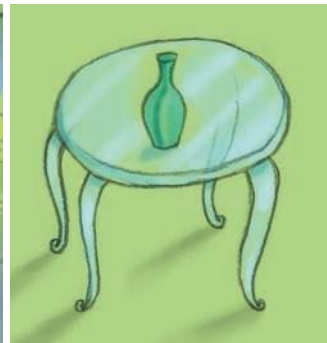
6 A table with a .....