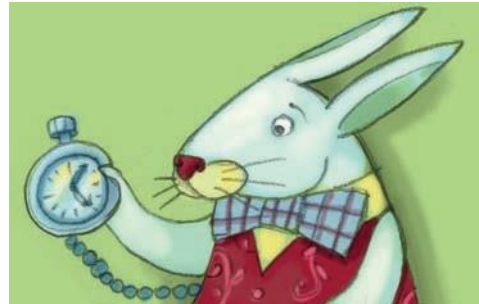
0 A rabbit with a w . a . t . c h.....

pictures doors key bottle watch cake mouse