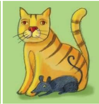
3 A cat with a .....