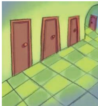
5 A hall with .....