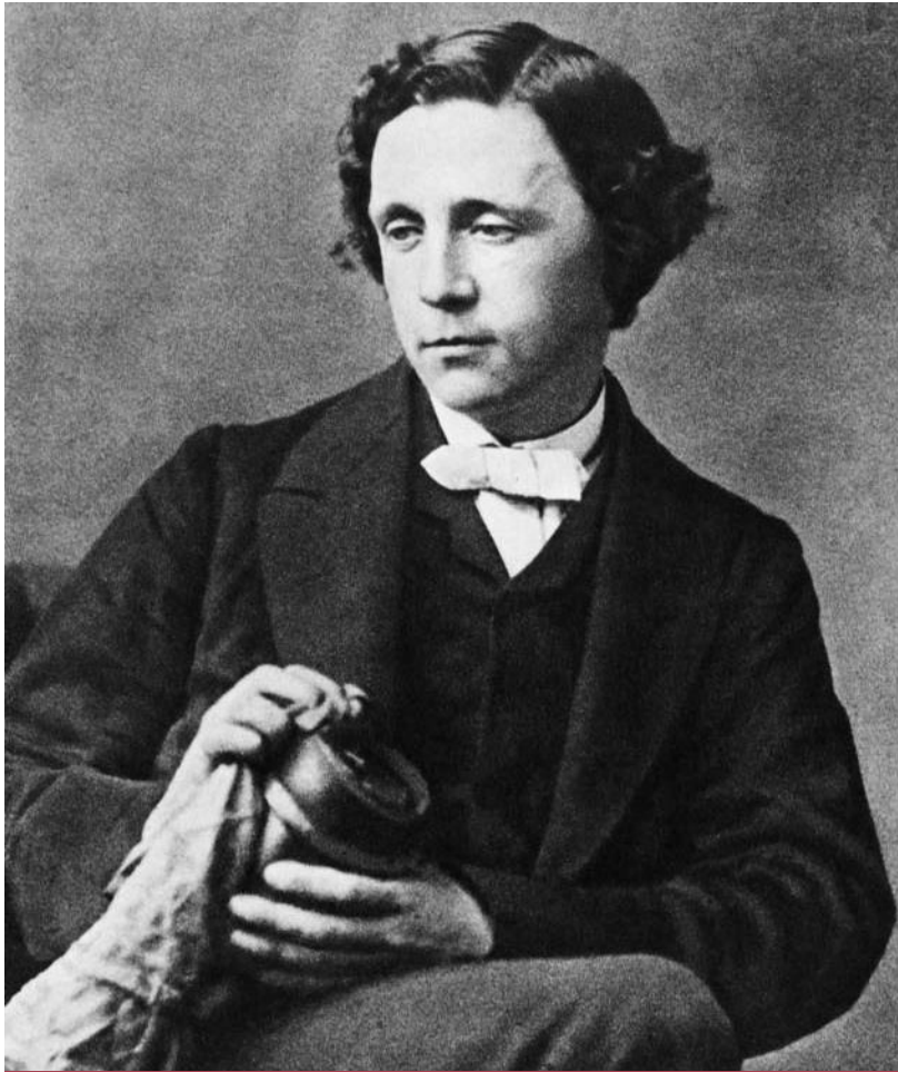
Lewis Carroll (about 1863)