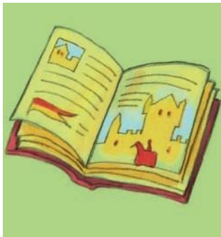
4 A book with .....